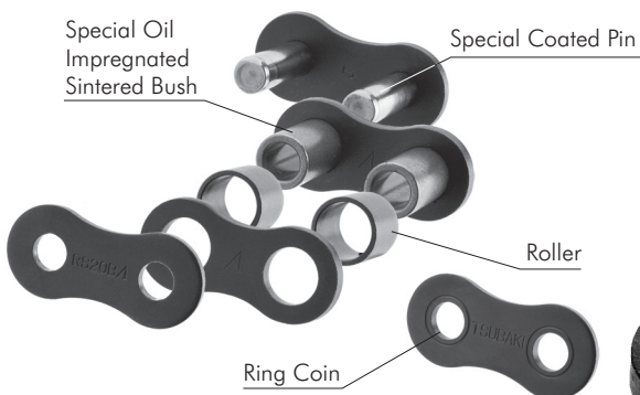
Fig. 14 Basic Construction

Due to the extended lifetime of ANSI LAMBDA chain, TSUBAKI advises to install sprockets with hardened teeth in every LAMBDA application.